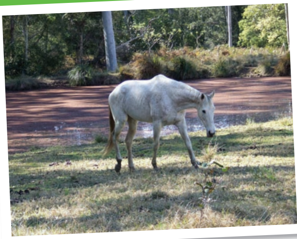
Mythri - softer, kinder, more relaxed