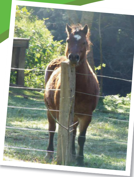
Better but i've still got my eye on those oranges . . .

connected on any level at all and I knew that she really appreciated the efforts I was making to have her history healed, and she showed me, in that moment, her good and generous heart. Her future here was therefore secured.