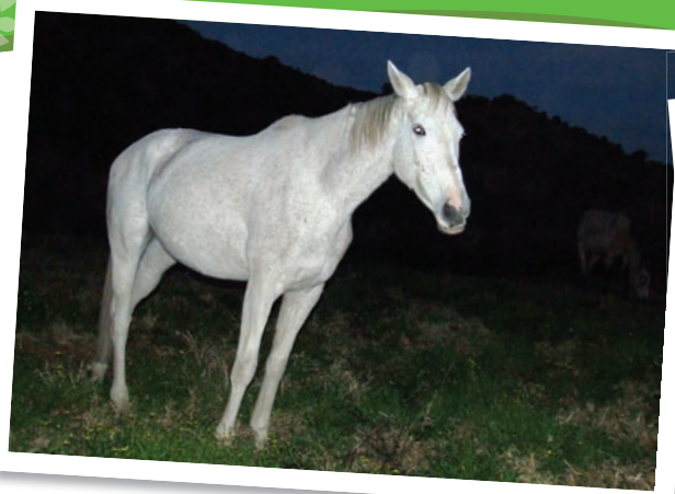
The ghost who walks . . . The restless gypsy